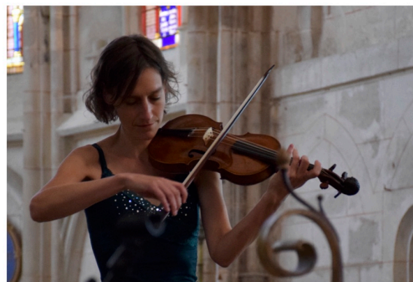
August 2019, concert in St. Pierre, Tonnerre